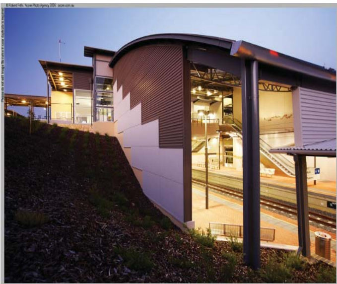
Thomas Road Station

MPS Architects believes clients, stakeholders, consultants and our staff are all equally important and that the process must always be enjoyable.