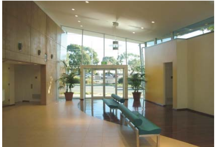
NASAS , Royal Street East Perth